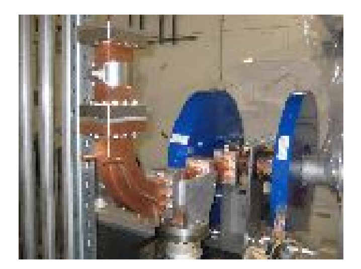
Figure 2: RF gun AlphaX installed in the NEPAL beamline.

Finally, the major part of the beamline was completed in June 2008. A picture of the update state of the NEPAL station is shown in figure 3.