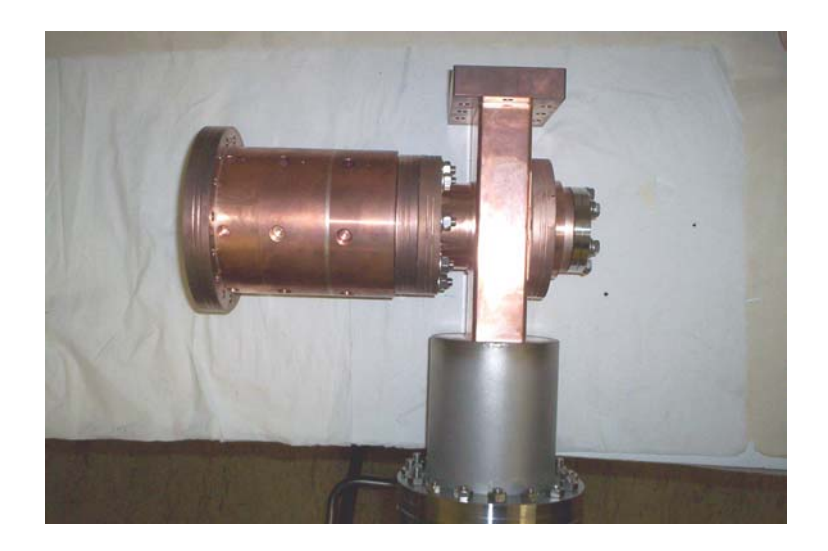
Figure 1: AlphaX RF gun.

In waiting for the PHIN gun it was decided to install in the NEPAL station another 3 GHz RF gun built by LAL called AlphaX RF gun [3]. So an electron beam could be produced in the NEPAL station in the beginning of 2009. The AlphaX gun is also a 3 GHz 2,5 cells (see figure 1), the biggest difference with respect to the PHIN gun consists in a coaxial coupling of the gun with the waveguide instead of hole coupling.