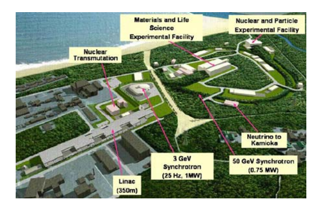
Figure 2. Birdview of the JPARC laboratory at Tokai.