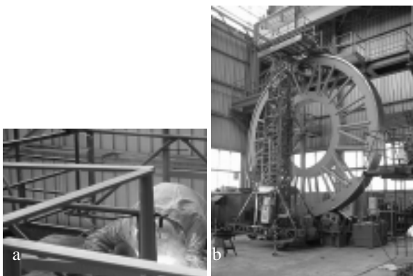
Fig. 4: The shell of the prototype mandrel during welding (a) on the roll-type positioner (b).

The welded shell is moved on the bed of a vertical lathe by a lifting balance. Up to 4 mm of material are removed from the outer surface by rough turning. The out-of-roundness of the shell is first checked at this stage. Two symmetric double-J-grooves (the second after tilting the shell by 180°) are machined at the ends of the shell on the same vertical lathe. After bevelling the shell edges, the stiffener is removed and the inner surface of the shell is turned, removing up to 6 mm of material.