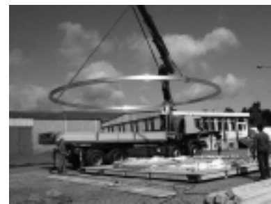
Fig. 3: A pre-machined ring during insertion in the shipment box.

The firm Dembiermont in Hautmont (F) is capable of producing seamless rings up to 8 m diameter and 40 t weight. The use of a computer controlled, multiple mandrel, radial-axial ring mill of German fabrication (the largest in Europe) allows rings of high planarity and circularity tolerances to be obtained (Fig. 2b). A relationship between radial and axial cross-sectional reduction is selected, controlling the diameter growth rate during the rolling. Rolling is followed by a final cold expansion (performed in an expander capable of treating rings up to 8 m), aimed to calibrate the ring and, in our case, to confer the adequate mechanical properties to the ring by cold stretching. The rings are subsequently pre-machined (including the welding chamfers) by Dembiermont on a vertical RAFAMET lathe.