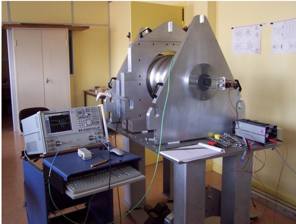
Figure 2: bead-pull setup on the cavity tuning bench

The field measurement is shown in figure 3. The field distribution is uneven, the ratio between the field in the first and forth cell is 3.5.