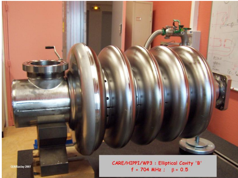
Figure 1: Cavity B ready for surface preparation and qualification test in vertical cryostat

This cavity was fabricated by ACCEL and delivered on March 27 th 2007 at Saclay.