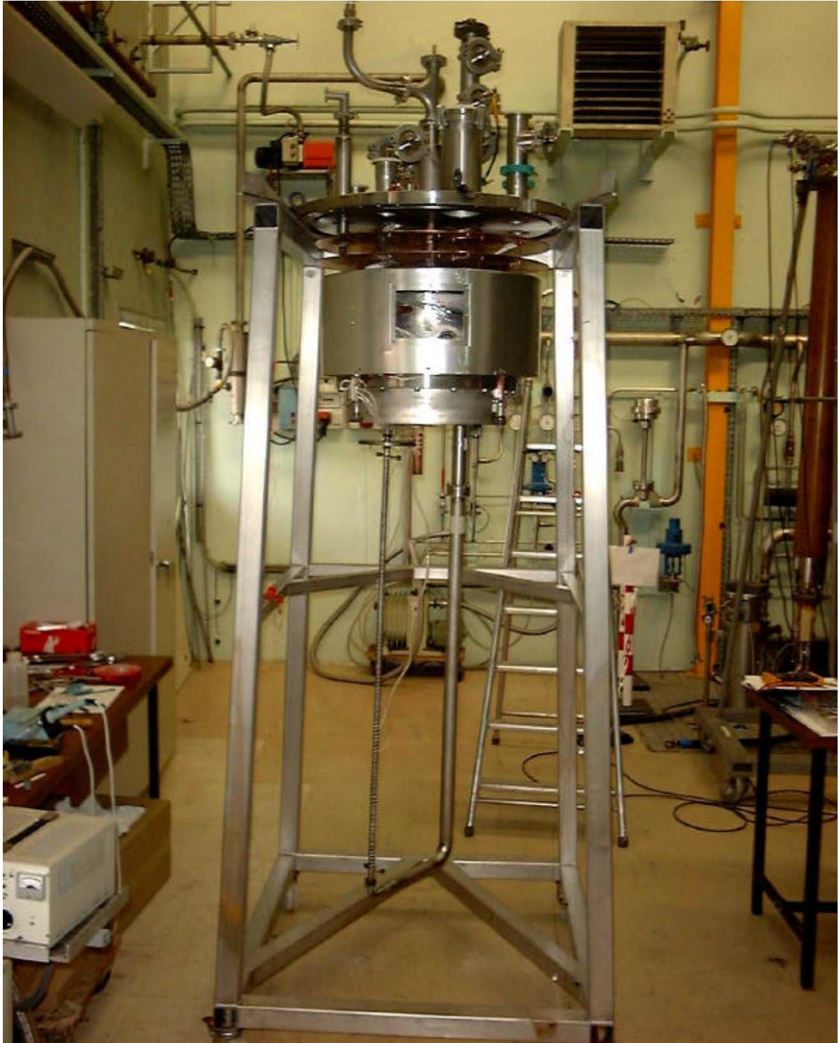
Figure 2. Picture of the experimental facility